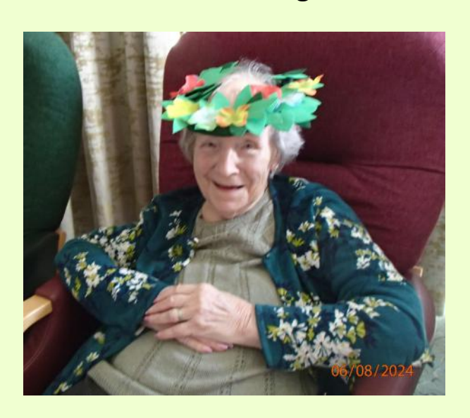
Our 'Tour de France' style team outfits (and