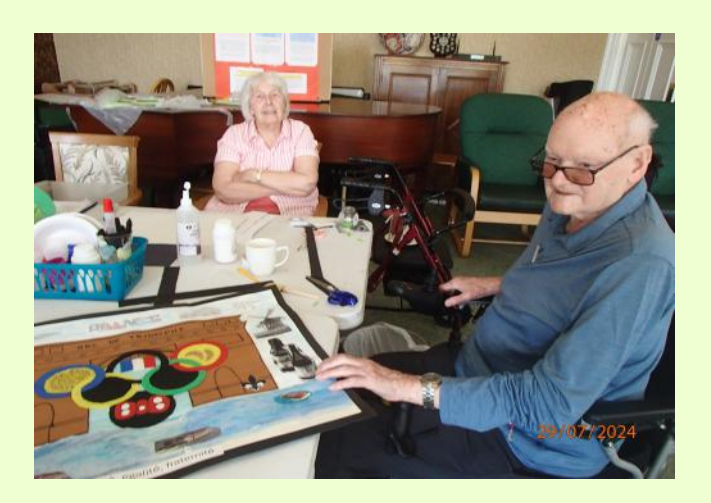
Working on our Team Poster and our Laurel Wreath