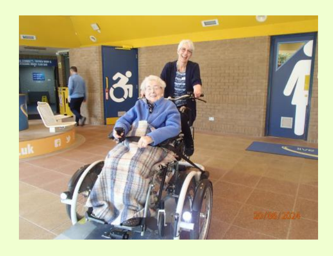
Wheelchair bike at Bell's Sports Centre: ride around the North Inch