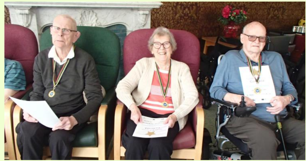
Our winning team: the 'Kingpins' (top three scores in the games)